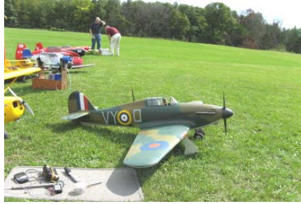
Chuck Backman flew a Hurricane and a Cub Special PA-11 which was modeled after Dick Knutson's restored airplane. Chuch first flew the model at the Lodi airport in 1989 as a tribute to Dick's full size restoration done at the Lodi airport.