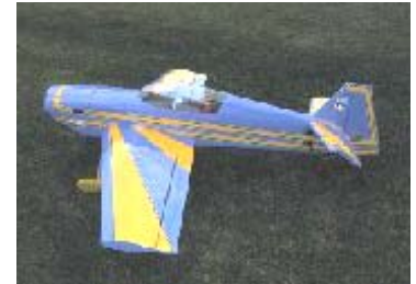
The "Tip Stalling Monster"

The first flight with the new wings, instantly a huge difference in flight performance, high alpha flight is rock solid, blenders and waterfalls exceptional. I recovered the wings to match the fuselage after about the 5 th flight, starting to see flight characteristic problems. Pitch coupling with any rudder input, and not enough rudder to stand the fuselage back up when pointed straight up (hover). Seventh flight, something is definitely wrong, attempting any rolling maneuver, the pitch coupling is so bad you can't continue, a rolling circle falls out and goes nose over tail. What I am finding is the difference in wing to fuselage is too large; the fuselage is 82in and the wing 105in.